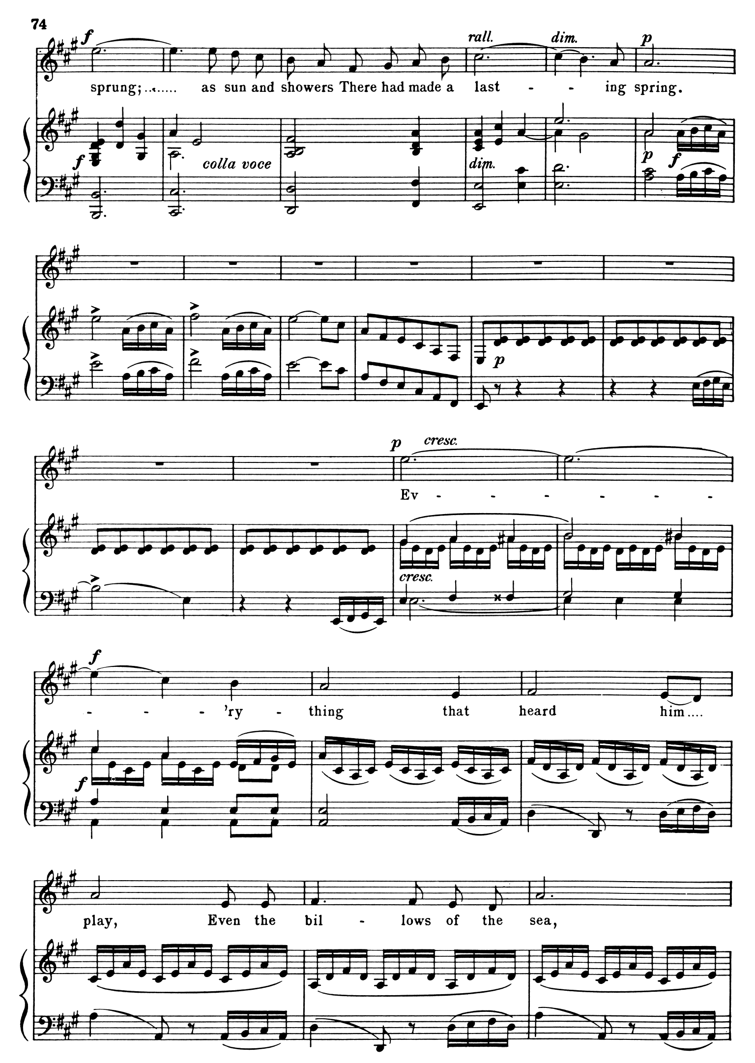
B.& H. 17180