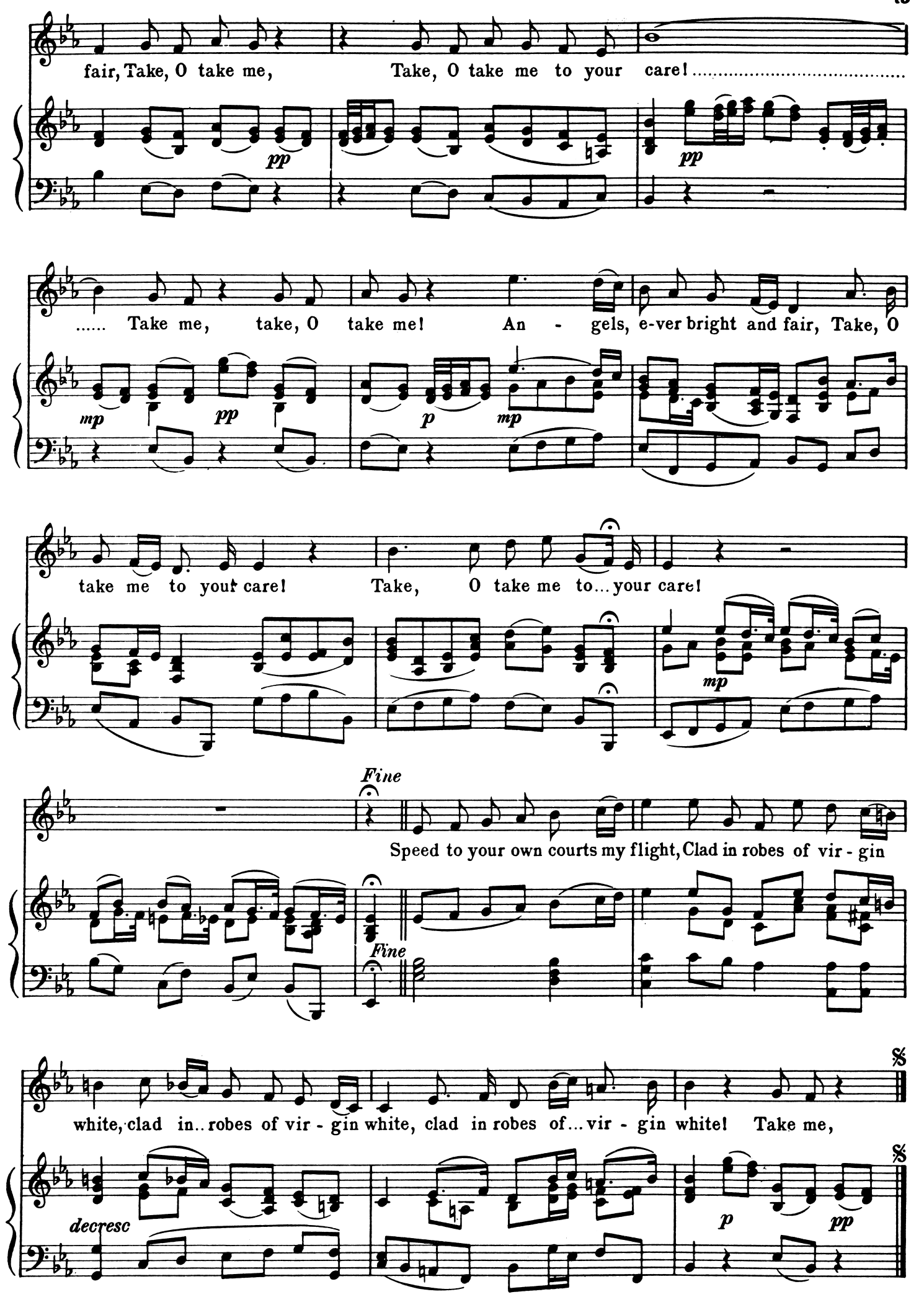
B.& H. 17130