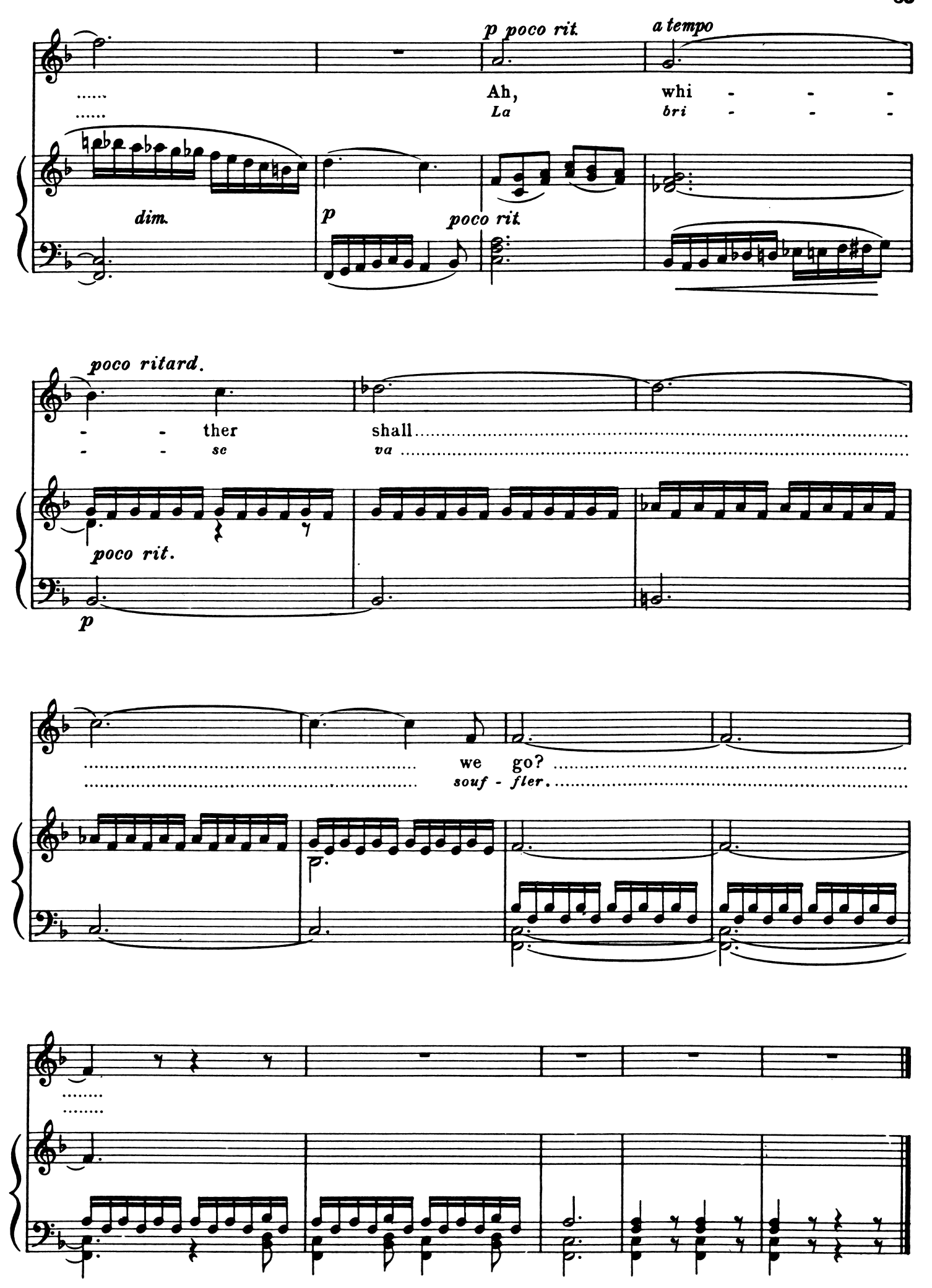
B.& H. 17130