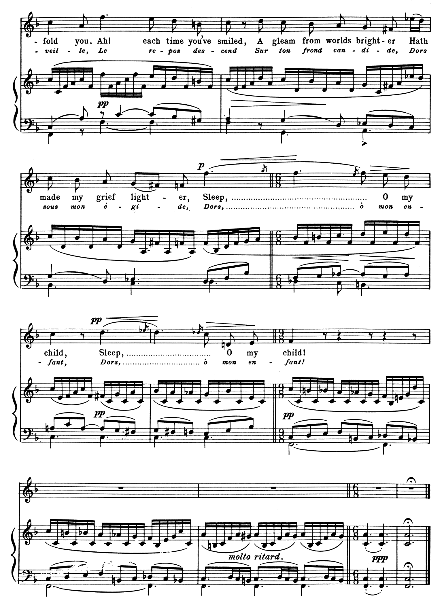
B.& H. 17130