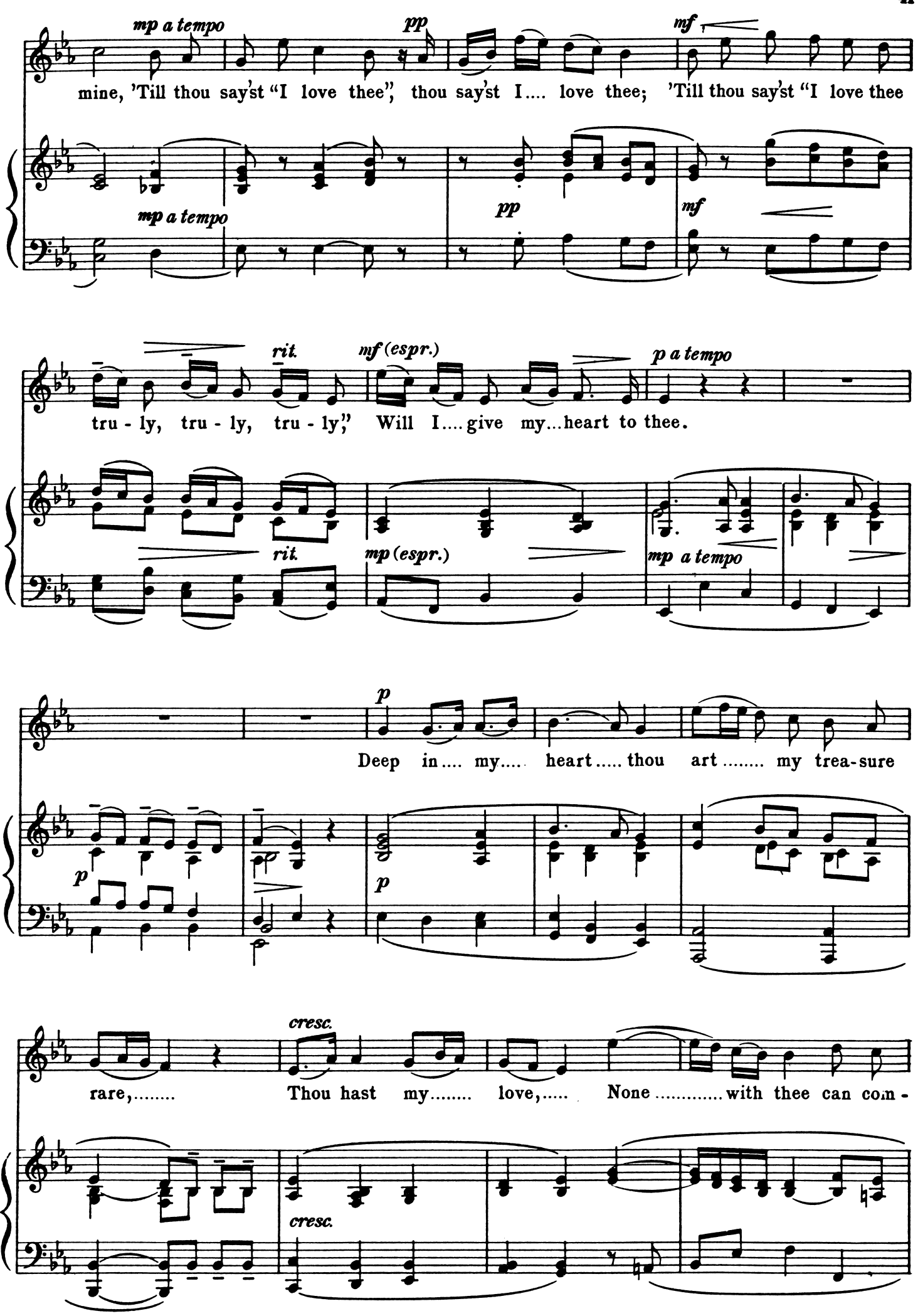
B.& H. 17180