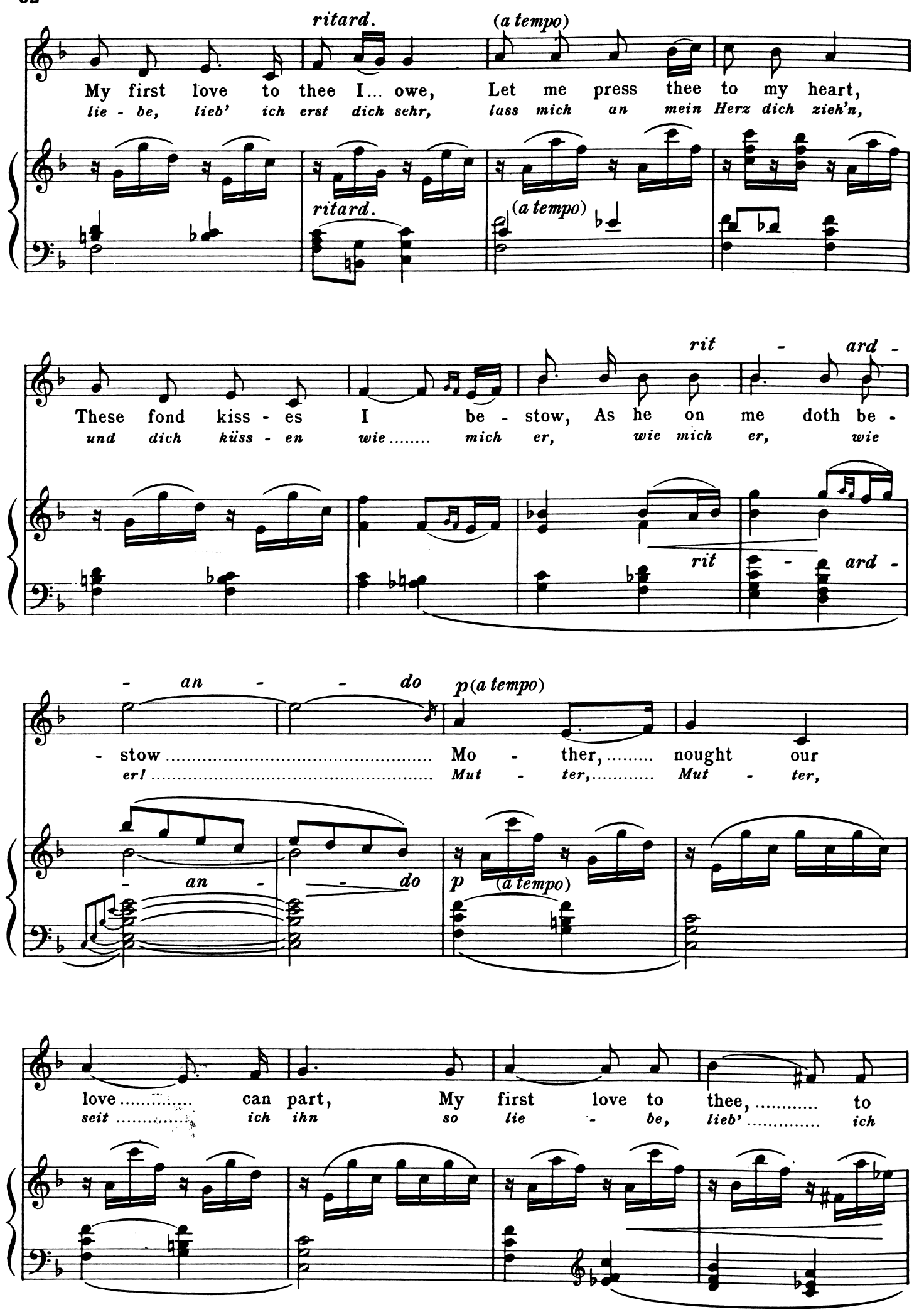
B.& H. 17130