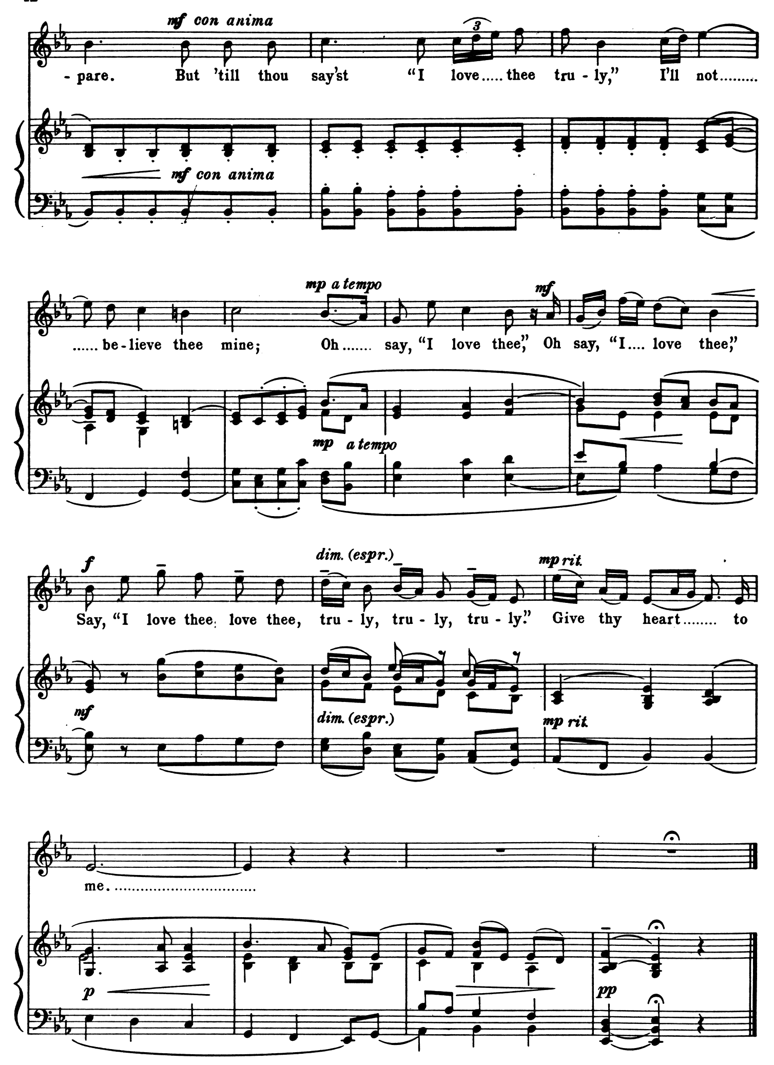
B.& H. 17180