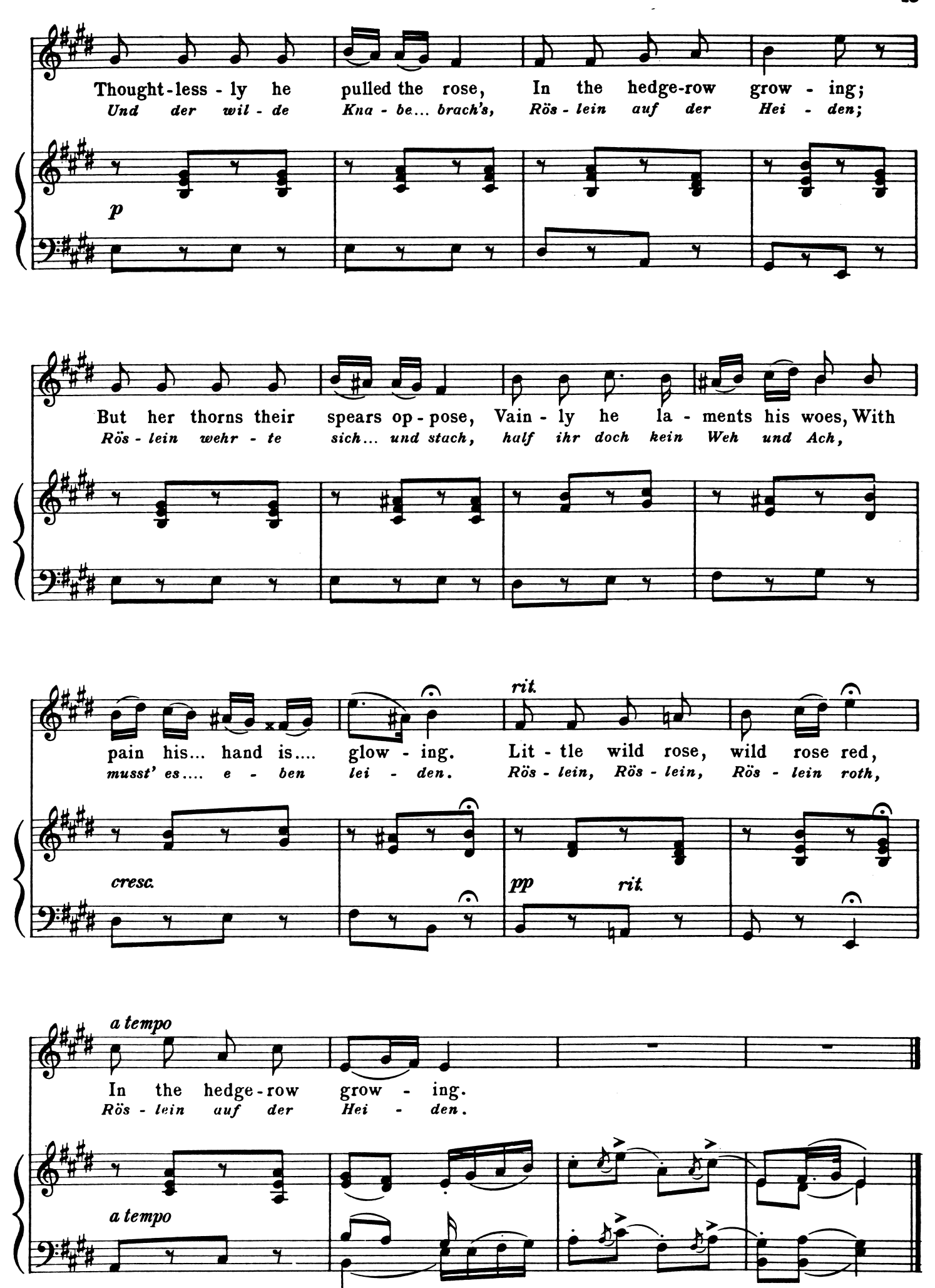
B.& H. 17180