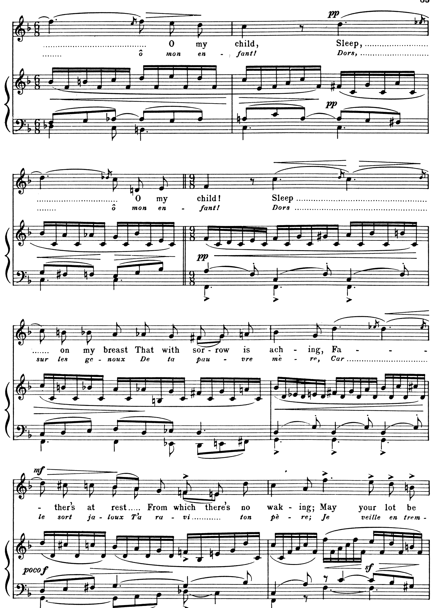
B.& H. 17130