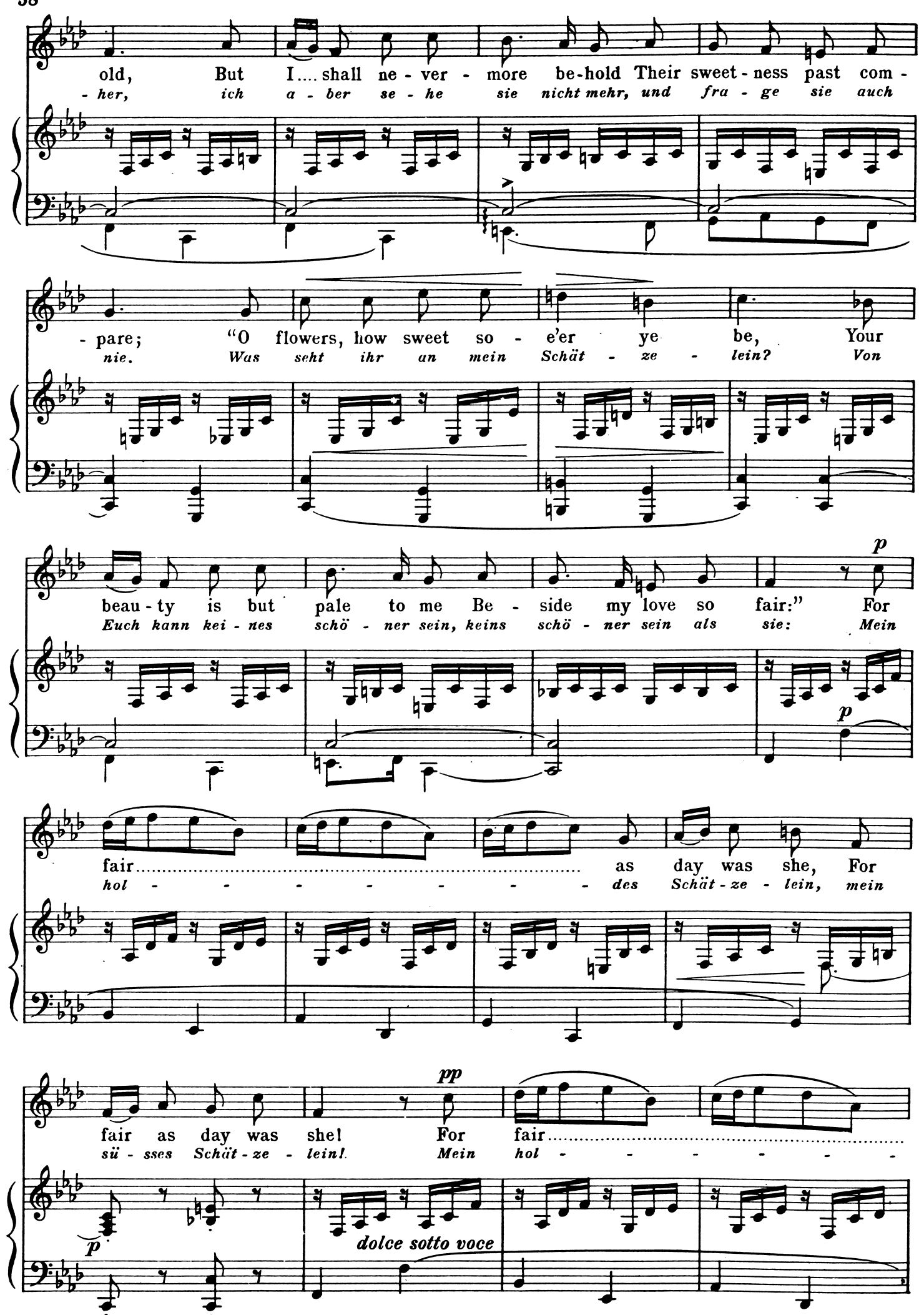
B.& H. 17180