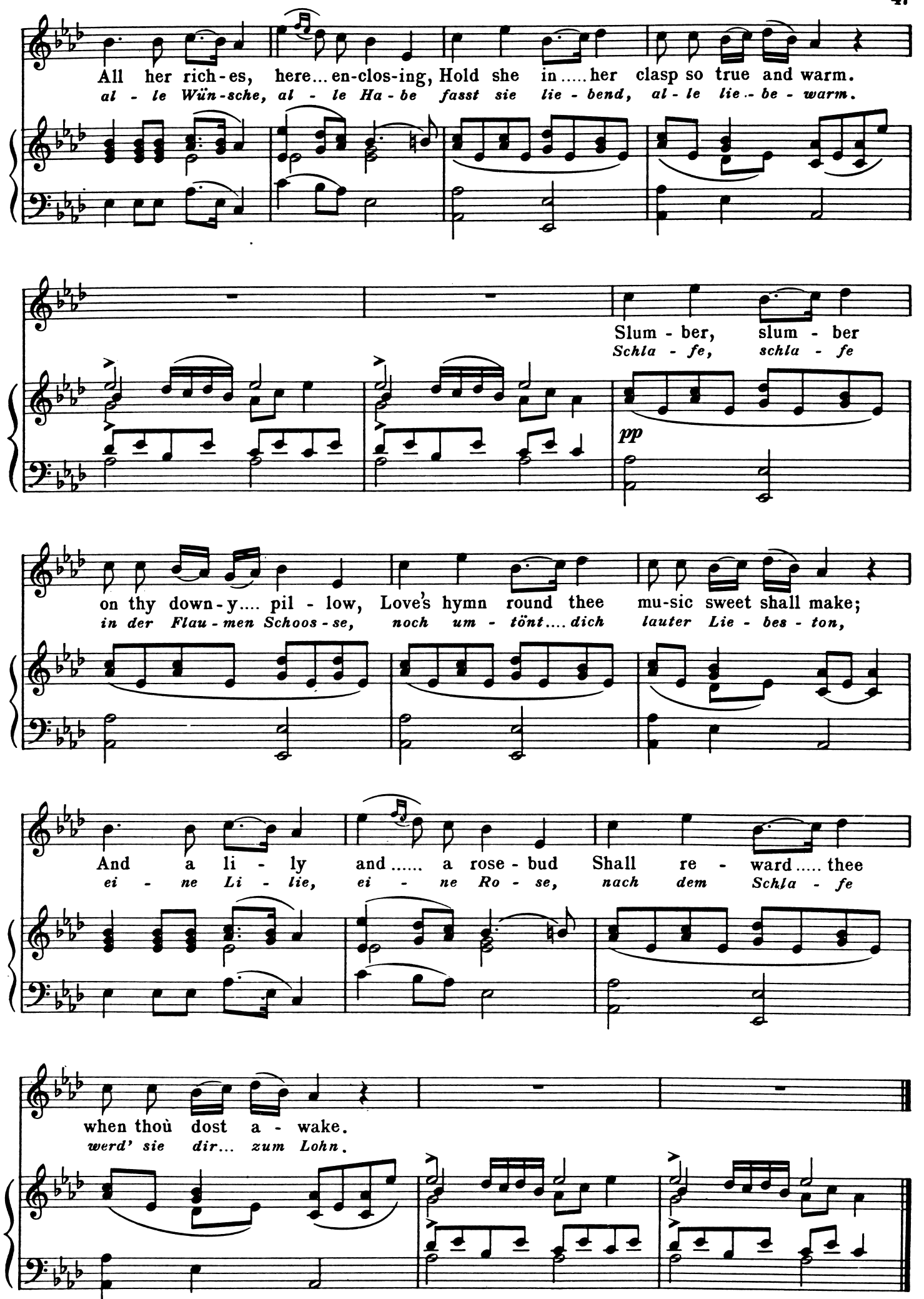
B.& H. 17130