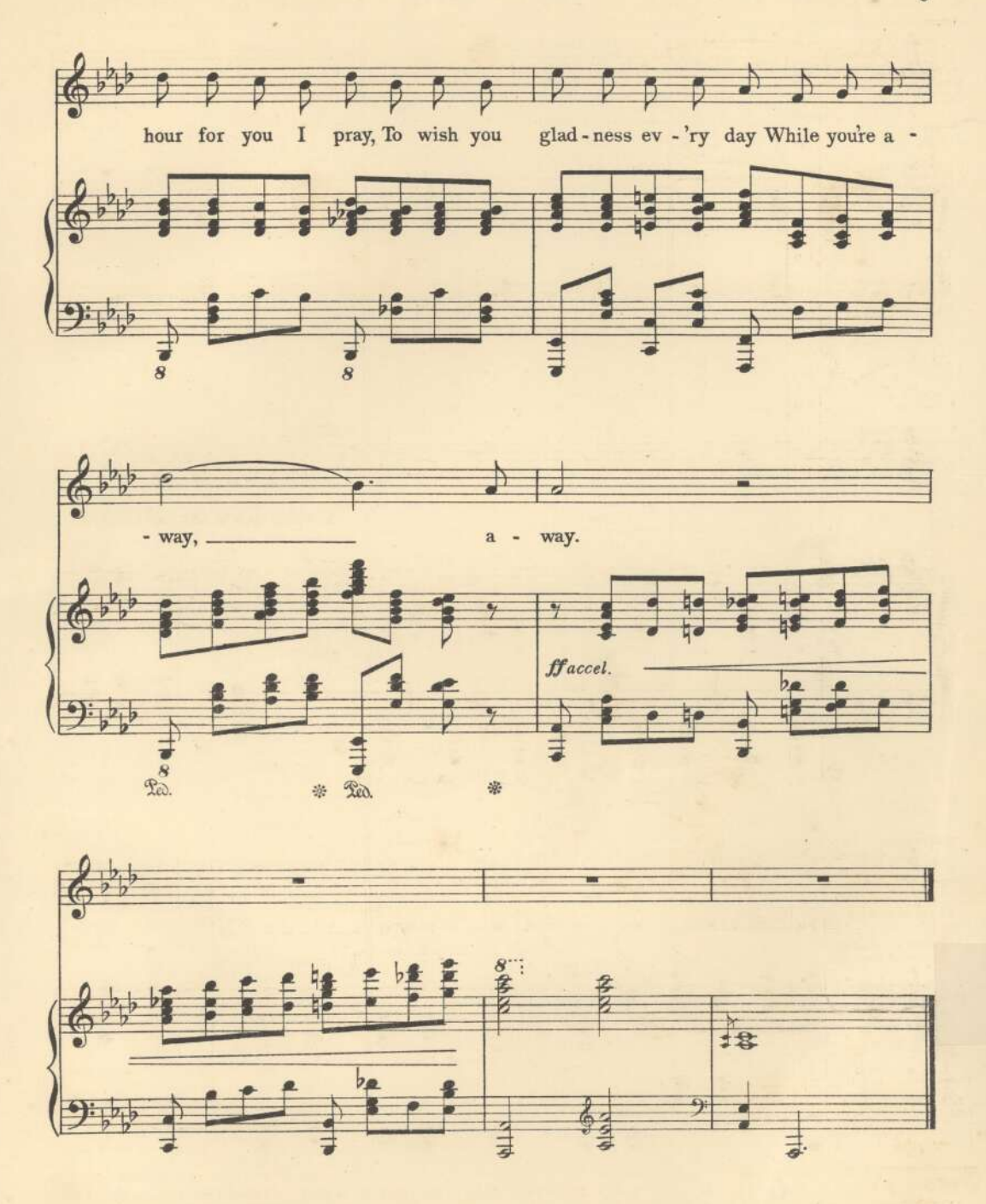
28873 THE MELBA METHOD - Dame Melba's personal advice on Singing - Price 6/- net. Chappell.