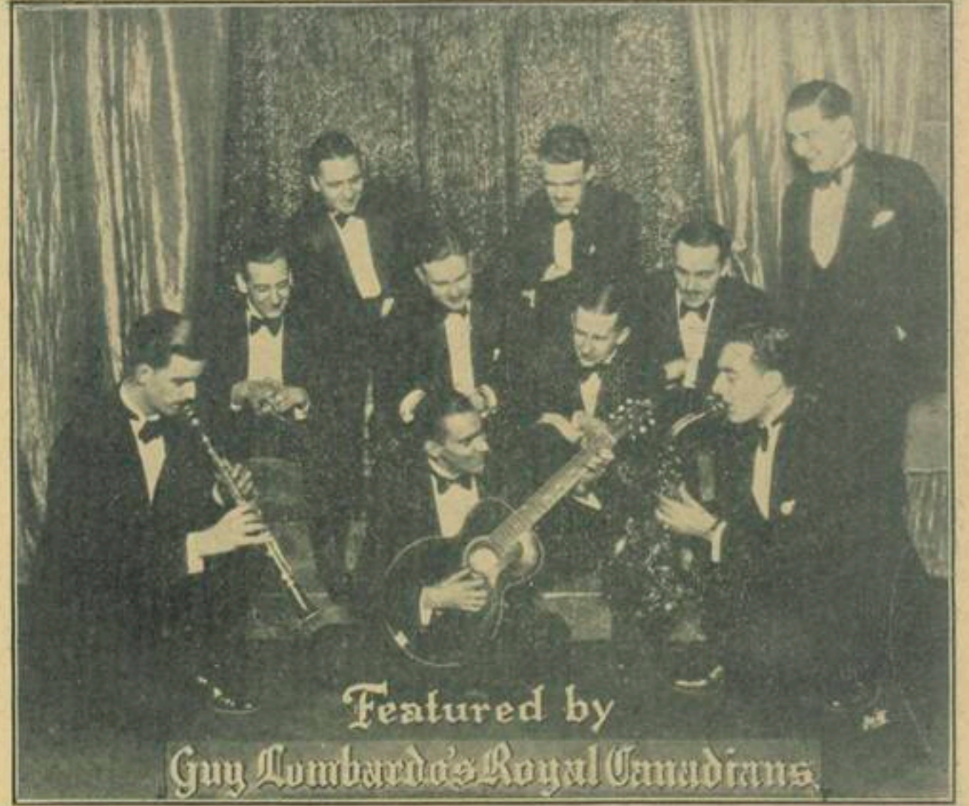
Featured by Guy Lombardo's Royal Canadians